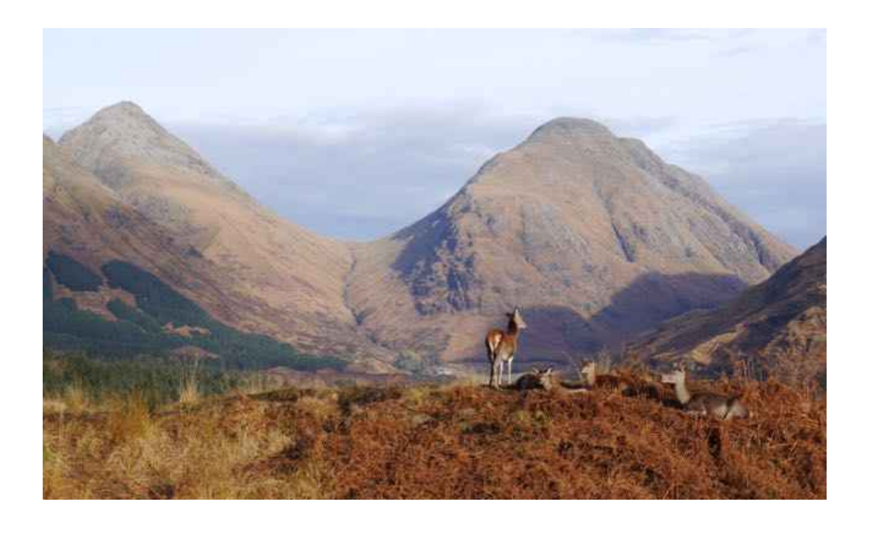
Autumn in Glen Etive