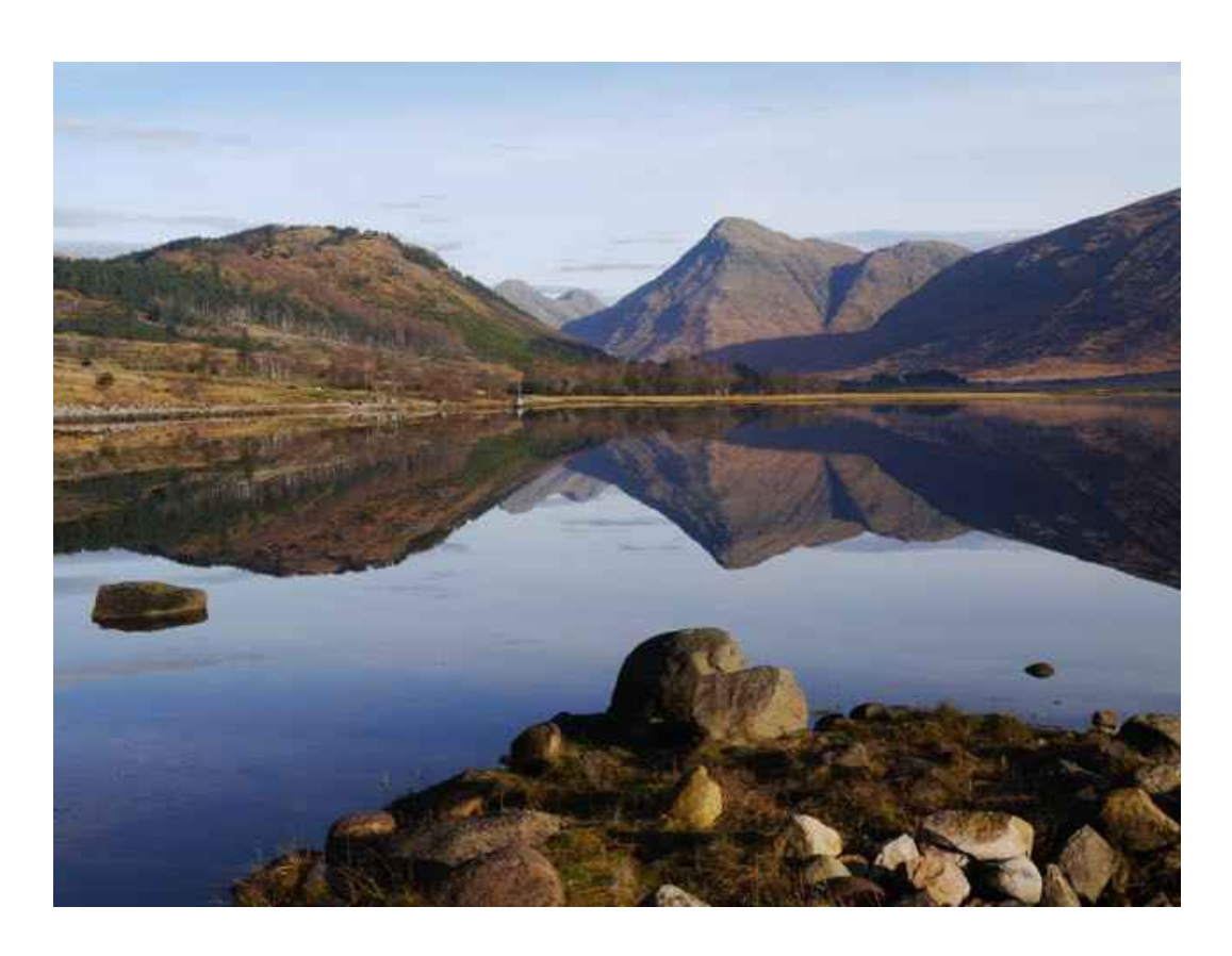
Loch Etive reflections