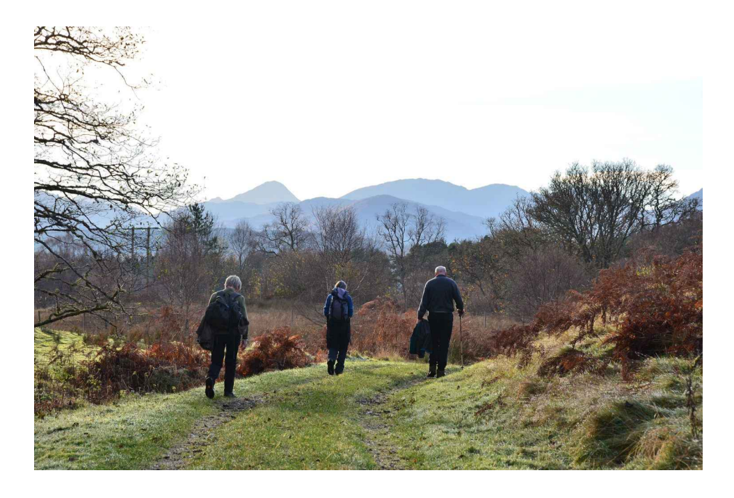
Heading home under clear blue skies.