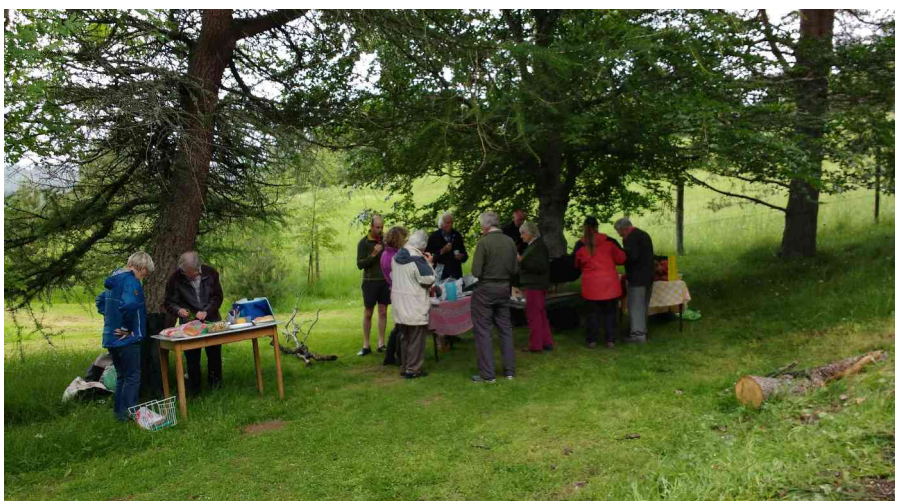
Sitting round the bonfire waiting for the barbecue to warm up.