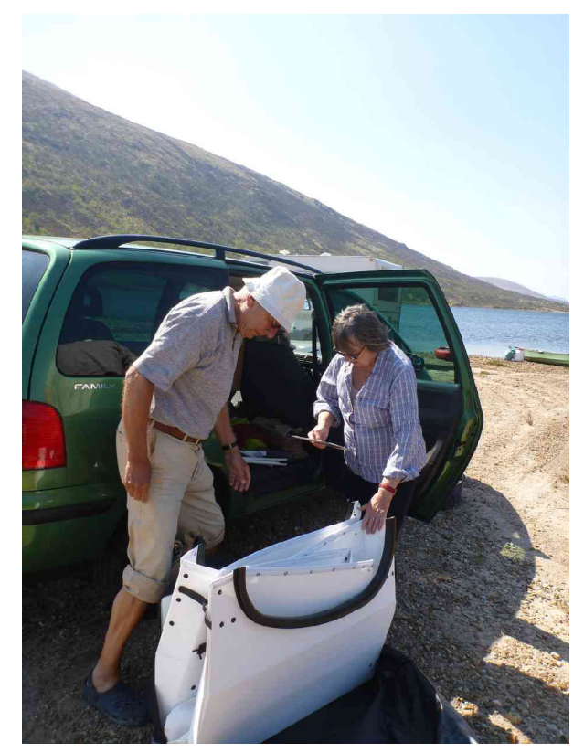
Kayak origami: from ...

Saturday 14<sup>th</sup> May. The week has gone so quickly – and still so many things to do in the area.