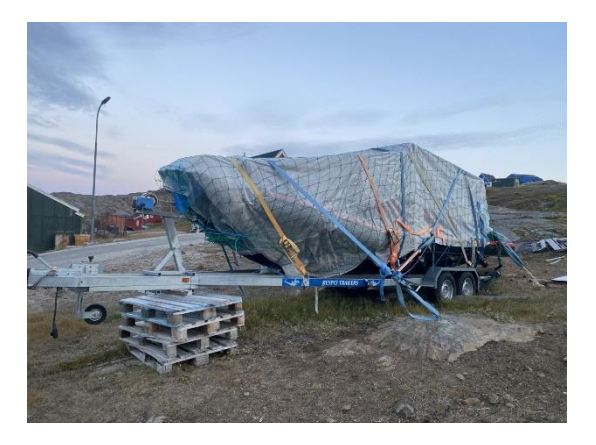
New winter cover for "Rana"; note the ground tie-downs.