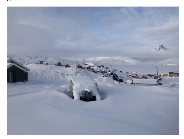
Rana in her winter quarters spring 2019 having the previous winter survived a gust of 182mph in Nov 2018